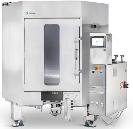
Fig 7. 3000 L mixing tank shown with electrical cabinet and controller.

The mixing tanks are vessels or totes in which the single-use biocontainers are installed (Fig 7). The tanks are available in 2000 and 3000 L nominal capacities in a variety of configurations, with options for load cells, a thermal jacket, and/or American Society of Mechanical Engineers (ASME) certification for versions including a jacket. They consist of an integrated drive unit on the bottom, which rotates the magnetically-coupled impeller inside of the single-use biocontainer.