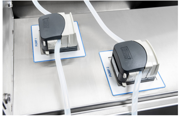
Fig 9. Integrated dosing pumps can be controlled remotely for transferring fluid into the single-use biocontainer.