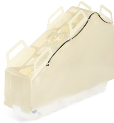
Fig 3. Xcellerex magnetic mixer biocontainer shown in folded state with protective rigid folding base.

The biocontainer (Fig 3) is constructed with Allegro film and includes an impeller (Fig 4). It contains a rigid folding base, which folds around the outside layer of film to offer added protection but does not come in contact with the process fluid. The single-use biocontainers are available in two different configurations, both in 2000 and 3000 L sizes. See ordering information for additional details.