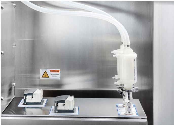
Fig 5. Inflation sets are used to connect the inflation system, which is found in the electrical cabinet, to the biocontainer.

The general use inflation set includes two tubing assemblies, each containing a Kleenpak™ capsule with Emflon™ II membrane in sterilizing grade air filter, AdvantaPure® braided, platinum-cured silicone tubing, and 1.5 in. Tri-Clamp™ sanitary flange fittings at both ends. These are suitable for use with either the standard configuration biocontainer or general-use configuration. The filters are hydrophobic to prevent water ingress into the electrical cabinet and are therefore required to be used for all applications, including non-sterile applications. The filters may not be reused since saturation of the filters impacts inflation, venting, and hydrophobic capabilities.