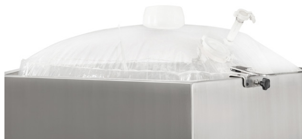
Fig 14. Fully inflated biocontainer extends above the top of the mixing tank.