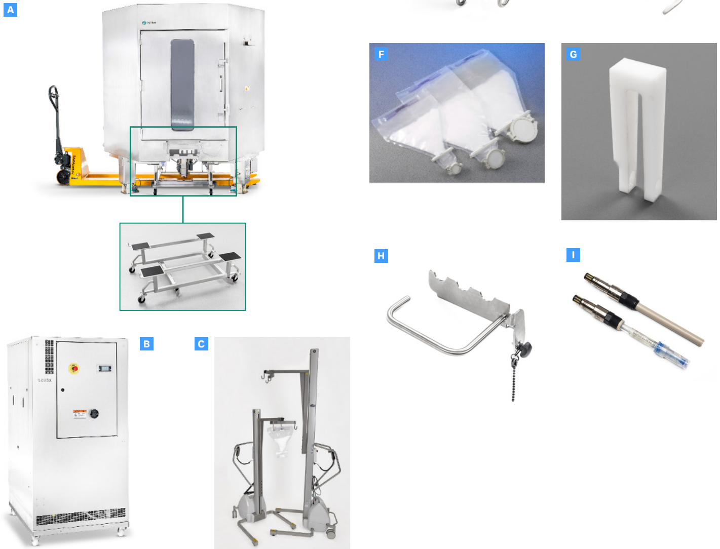
Fig 11. Accessories and spare parts available for Xcellerex magnetic mixer systems.

Several accessories and spare parts are available for process-specific needs or facility layout (Fig 11). See ordering information for additional details.