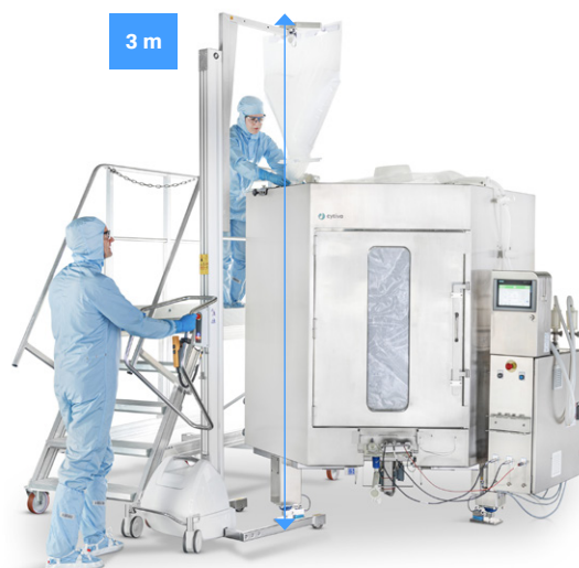
Fig 13. Minimum ceiling height required when using 3000 L mixing tank with 30 L powder bag and optional compact hook for powder lift.

Table 3 provides details regarding clearances for operating the mixing system, depending on the combination of products being used.