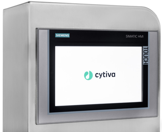
Fig 10. The controller offers a touch screen interface for local monitoring and control of the mixing system.

The controller (Fig 10) provides local control of the mixer through a touch screen and operator-friendly HMI. Although being optional, it is necessary for situations where a local control option is desired. It provides the possibility to locally control the speed of the impeller, inflate the biocontainer with air, and sense parameters including pH, weight, temperature, and conductivity. Without the controller, only remote control of the system is possible.