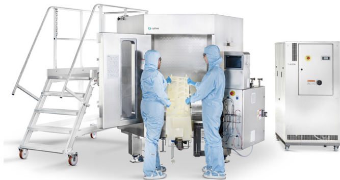
Fig 2. Rigid folding base serves as a carrying case for simple installation.