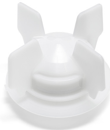
Fig 4. Xcellerex magnetic mixer single-use impeller.