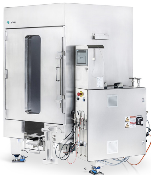
Fig 1. The Xcellerex magnetic mixer 3000 L system pictured with mixing tank, electrical cabinet, and controller.