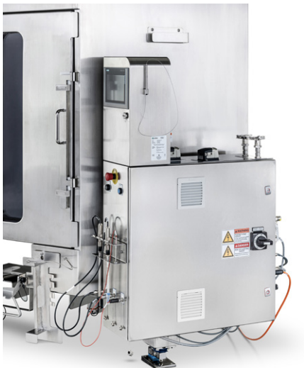
Fig 8. Electrical cabinet attached to mixing tank, pictured with controller on top.

The electrical cabinet (Fig 8) provides the equipment necessary to deliver mixing, sensing, weighing, dosing, and air-inflation capabilities when paired with a mixing tank, and is required for operation on all systems. A separate part number from the mixing tank must be ordered along with each mixing tank for operation. It contains two integrated peristaltic pumps for fluid dosing (Fig 9). The electrical cabinet consists of the inflation system and has connections for the single-use inflation sets. It contains the electrical connections for pH, conductivity, and temperature sensing probes, as well as communication ports for remote control of the system. If only using the electrical cabinet and the mixing tank, the system must be controlled remotely by a SCADA system or DCS. The system can only be controlled locally when combined with the optional controller.