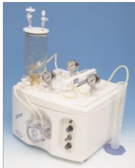
Photo of Minimate TFF Capsule on a Minim™ pump station with 0-4 bar (0-60 psi) pressure gauges