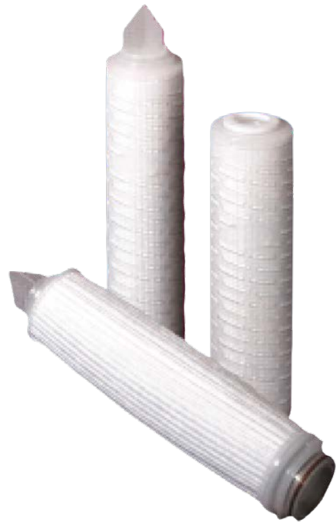
Fig 1. Emflon FM filters.