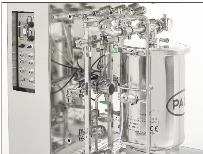
Side view with communication ports shown