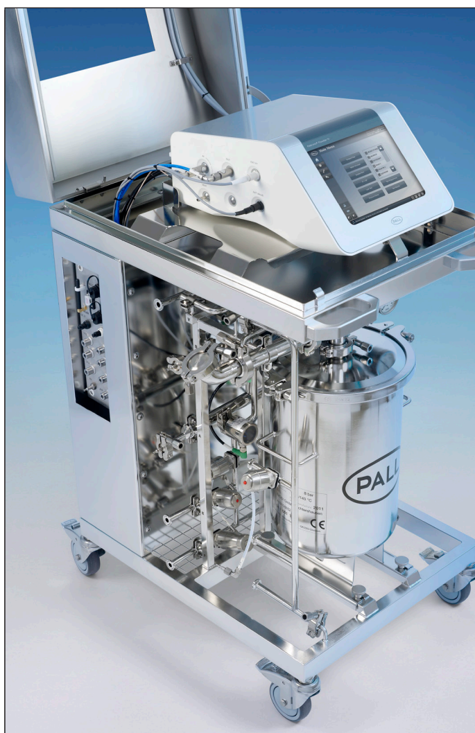
Lid raised to show Palltronic Flowstar instrument inside

As an alternative to use of the integrated printer, print data can be exported to an external printer, either networked or connected via USB. Print data can easily be exported electronically in a variety of standard formats including PDF or XML.