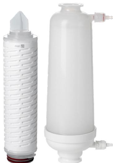
Fig 1. 254 mm (10 in.) filter cartridge and Kleenpak™ Nova filter capsule.

Options are available for steam-in-place (SIP) or gamma-sterilized filters for integration into single use systems, to suit all facility types.