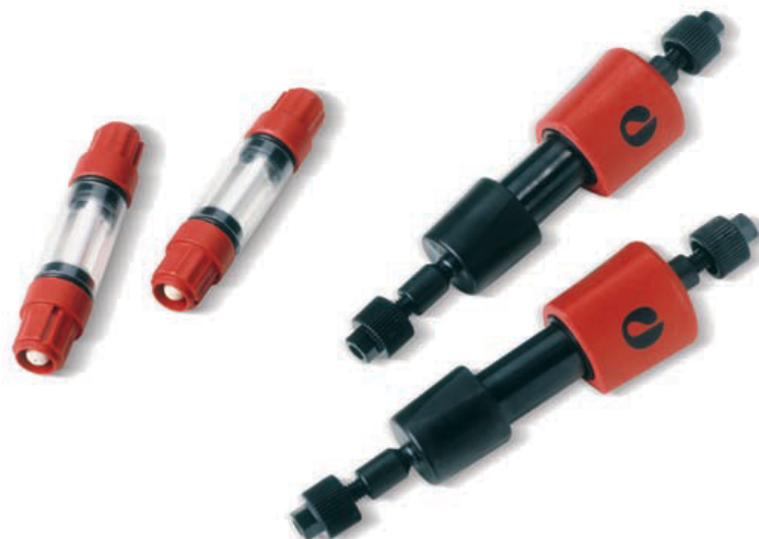
Fig 1. Mini Q ion exchange resin is available prepacked in Tricorn™ (4.6/50 PE) and Precision (PC 3.2/3) columns for high-performance purification of protein, peptides, and other biomolecules.

Due to their smaller bead size, MiniBeads give higher resolution compared with 10 µm MonoBeads™ resin in high-performance ion