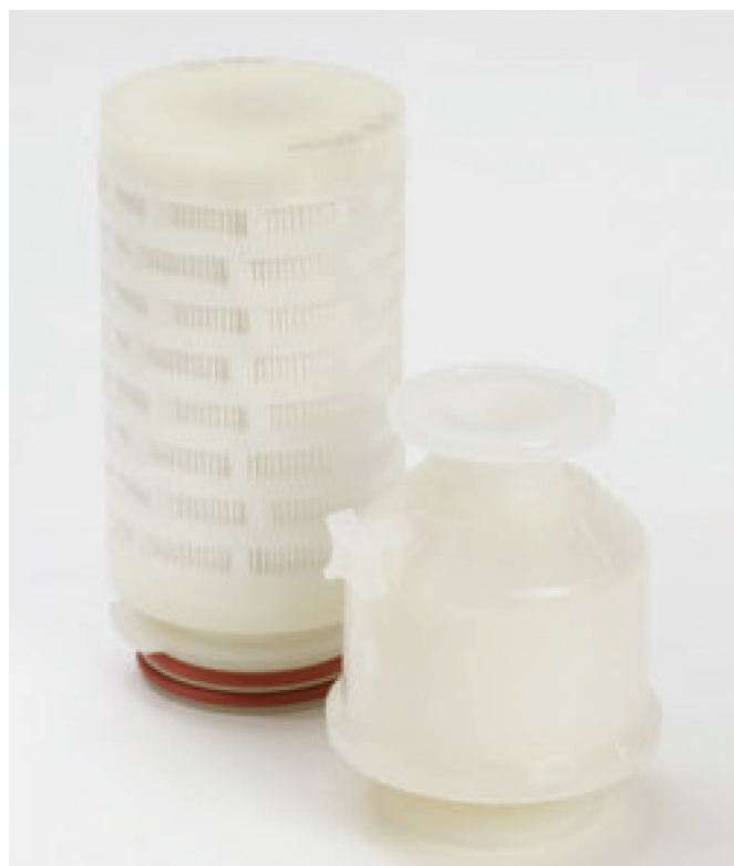
Fig 1. ULTA Prime CG filters