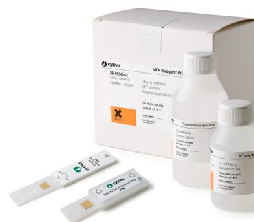
Fig 1. Sensor Chip NTA, Series S Sensor Chip NTA, and NTA Reagent Kit for capture of histidine-tagged molecules.

Attachment by capture has several advantages over covalent immobilization. Tagged proteins can be captured from crude media solutions, requiring little or no sample preparation. In addition, regeneration conditions are generic and therefore the need for assay development is minimized. Histidine tags are widely used since they are small and rarely interfere with the function, activity, or structure of target proteins. Two approaches for capture of histidine-tagged molecules are frequently used: Capture by an anti-histidine antibody; and capture on nickel-chelated NTA groups. Cytiva offers products for both approaches, Sensor Chip NTA with NTA Reagent Kit, and His Capture Kit (see Data file 29-0079-30). The choice between these alternatives often depends on the application. Sensor Chip NTA can be used for many different types