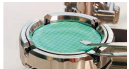
(C) Easy removal of the membrane.