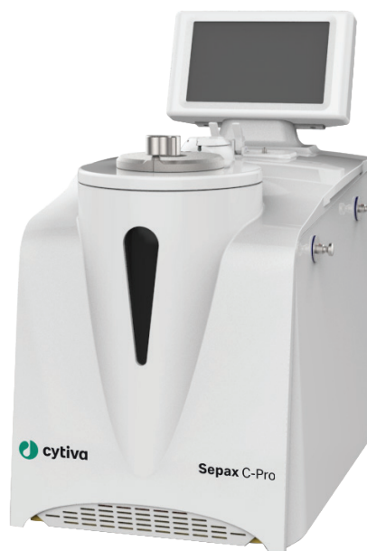
Fig 1. Sepax C-Pro instrument. The centrifugation chamber is in the middle, and the touchscreen is at the top.