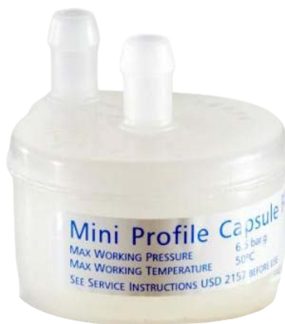
Fig 1. Mini Profile capsule filter.