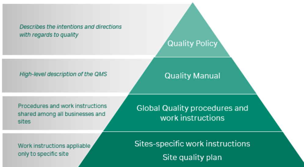
Figure 1 illustrates the various levels of QMS documentation.

Documents and records are maintained and retained in accordance with applicable requirements and standards.