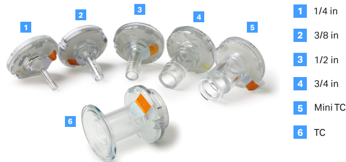
Fig 1. ReadyMate is available in six connection sizes.