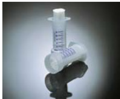
Fig 2. Autovial Syringeless Filters