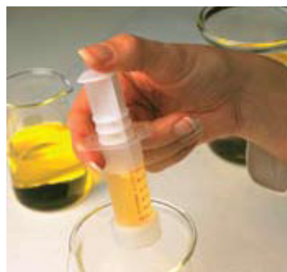
Fig 1. Easy to use one hand operation