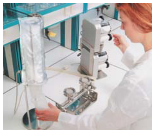
Fig 1. By taking a new pre-sterilized funnel, a membrane is dispensed automatically. (Workflow continued on next page).