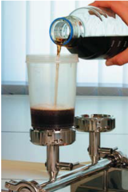
Fig 3. Liquid is poured into funnel and vacuum is activated.