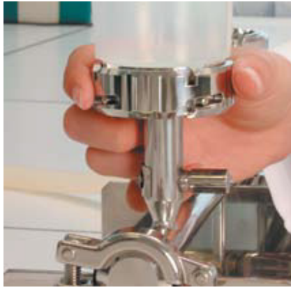
Fig 2. Pre-sterilized funnel is installed on filter base over membrane.