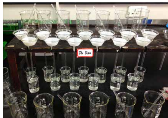
Fig 3. Retention of \text{PbSO}_4 precipitate using Whatman Grade 40 filter paper.