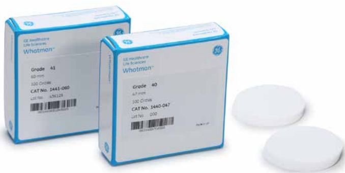
Fig 1. Whatman Grades 40 and 41 quantitative ashless filter paper.

In mining industries, analytical quality control (QC) laboratories routinely test the content of different metals in ore samples. Sample preparation is a critical factor in obtaining consistent results. Therefore, the use of high-quality, dedicated filter paper is expected to improve the accuracy of these metal content tests. Whatman quantitative filter paper from GE Healthcare Life Sciences is made from pure cotton and treated to wash away most of the impurities. Whatman quantitative paper is useful for gravimetric analysis and the preparation of samples for instrumental analysis. Compared with other papers, Whatman quantitative ashless filter paper (Fig 1) gives high loading capacity and particle retention, both of which are useful for the analysis of metals and other substances in ore samples.