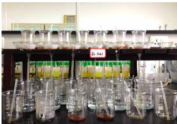
Fig 4. Use of Whatman Grade 41 filter paper in zinc analysis.