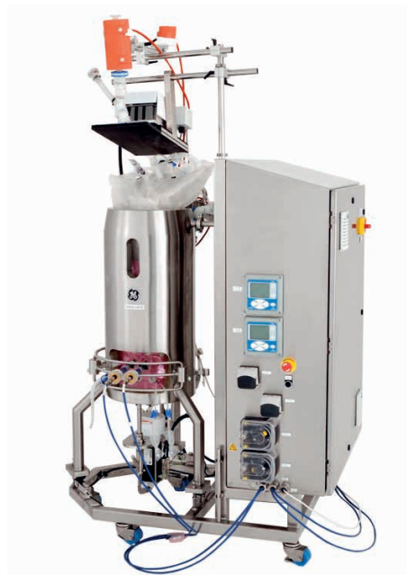
Fig 1. XDR-50 MO fermentor vessel and I/O cabinet.

The XDR-50 MO single-use fermentor is a 50 L turnkey, modular system that delivers performance comparable with hard-piped, stainless steel fermentor systems. Single-use technology eliminates time-consuming and costly clean-in-place (CIP), steam-in-place (SIP), and cleaning validation procedures. The system's turnkey design enables fast installation and start-up as well as rapid batch-to-batch turnover along with increased process flexibility