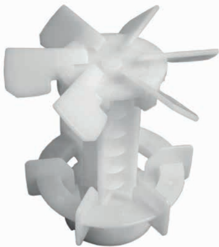
Fig 2. Two-stage impeller for efficient and application-specific performance.

The heart of the XDR-50 MO fermentor system is the XDR single-use bag assembly, designed and built to meet the stringent requirements of microbial fermentation. The single-use bag assembly is based on the design and materials used in the proven XDR technology for mammalian cell culture. The bag assembly consists of a USP Class VI low-density polyethylene fluid contact layer, tubing for liquid addition and harvest, gas sparging plate, sampling and probe ports, pressure sensor, filtered gas lines, and a high-power input agitator system. The exhaust line is fitted with a condenser to prevent exhaust filter blockage. The sparging plate has eight ¼" open pipe ports providing the high gassing rates required to maintain the dissolved oxygen (DO) necessary for microbial cultures. Robust agitation is provided by a powerful magnetic drive and a two-stage impeller (Fig 2). The first stage is a Rushton impeller which delivers excellent power into the system. The second stage is an axial-flow impeller operating in a pump down mode, improving gas residence time. The two-stage impeller combination results in very high oxygen transfer (> 1000 mM/h) to the culture medium.