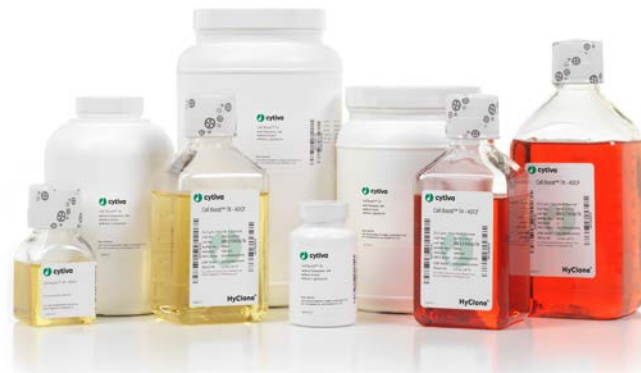
Fig 1. ActiPro, ActiSM, and Cell Boost 7a and 7b are designed for high yields of recombinant proteins in fed-batch culture processes with CHO cells.

The supplements should be added to the cultivation vessel as individual solutions and should not be mixed in advance as this will cause precipitation. The recommended ratio of Cell Boost 7a to 7b is 10 to 1 (v/v) (example feeding strategy Cell Boost 7a at 3% and Cell Boost 7b at 0.3%). The total amount of feed added and the specific feeding regime will need to be adjusted according to the nutritional requirements of each specific clone. The supplements are available as a powder or in a ready-to-use liquid format for research and process development. The liquid feed supplements meet testing specifications and are stable up to 12 months in PETE bottles and 9 months in bioprocessing bags at 2°C to 8°C (Fig 2).