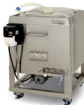
Fig 3. XDM Quad Mixing System, with a powerful motor and magnetically locked impeller, effectively mixes even highly viscous materials.

Our RRP program manufactures up to 200 L of your custom prototype formulation within seven working days of your request. Use our RRP service to expedite the development and testing of custom media for your biopharmaceutical manufacturing process.