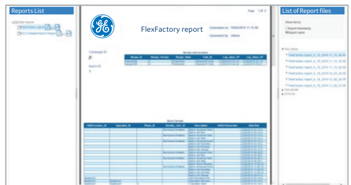
Fig 2. Dream Report provides powerful, proven reporting technology with distribution options including print, email and web.

The reports generated by Dream Report (see Figure 2) support manufacturing in a regulated environment, providing a validated audit trail for each batch and process. Integration and verification of the reporting software with the automation platform reduces the opportunity for user errors in data handling.